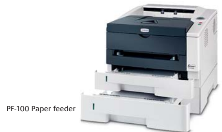
PF-100 Paper feeder

Product depicted includes optional extras